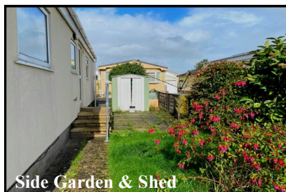
Side Garden & Shed