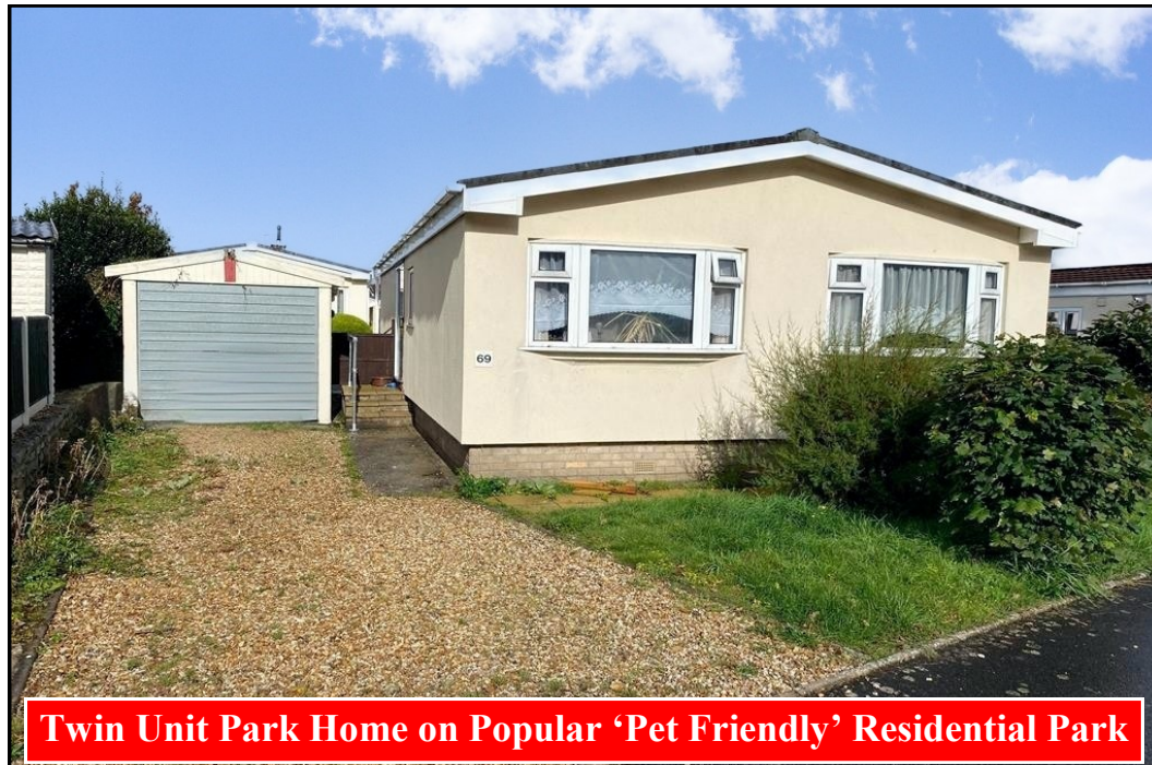
Twin Unit Park Home on Popular 'Pet Friendly' Residential Park

69 Oaklands Park, Crossways, Dorchester. DT2 8JQ