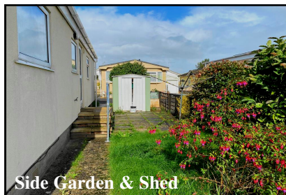
Side Garden & Shed