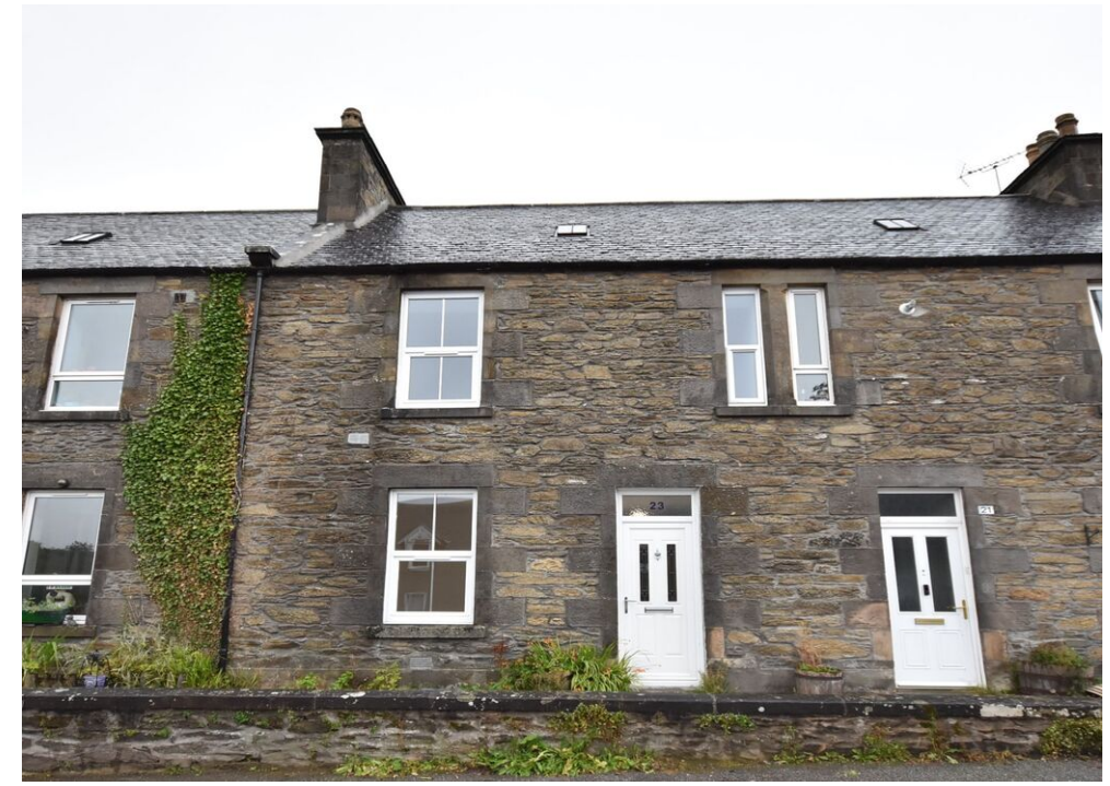
Fixed Price £125,000

Located within easy walking distance of Keith's local amenities is this 2/3 Bedroom Terraced House which has been modernised to include new hardwood internal finishing's and doors, new plaster boarded and skimmed walls with added insulation, a new gas central heating boiler and a new kitchen.