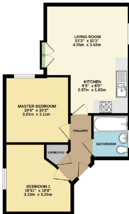
TOTAL FLOOR AREA: 501 sq.ft (46.6 sq.m.) approx.

While every attempt has been made to ensure the accuracy of the floorplan contained herein, measurements of doors, windows, rooms and any other items are approximate and no responsibility is taken for any error, omission or mis-statement. This plan is for illustrative purposes only and should be used as such by any prospective purchaser. The services, systems and appliances shown have not been tested and no guarantee as to their operability or efficiency can be given. Made with Memento 02023