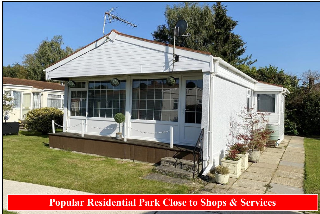
Popular Residential Park Close to Shops & Services

96 Gladelands Park, Ringwood Road, Ferndown, Dorset. BH22 9BW