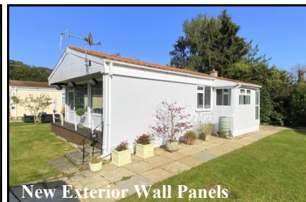
New Exterior Wall Panels