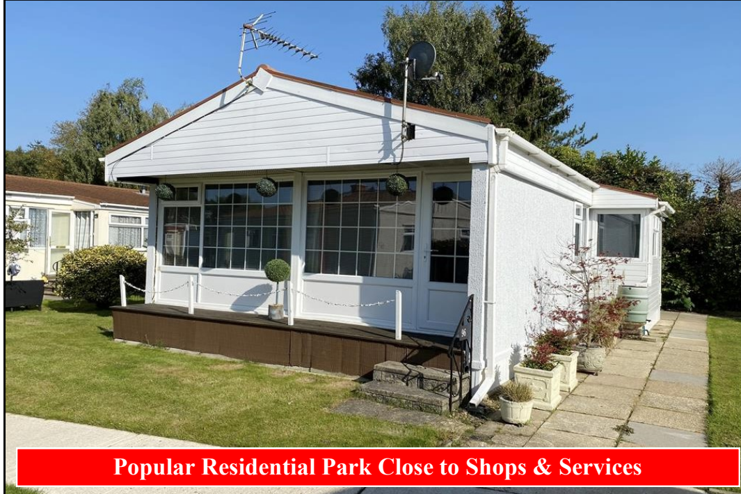
Popular Residential Park Close to Shops & Services

96 Gladelands Park, Ringwood Road, Ferndown, Dorset. BH22 9BW