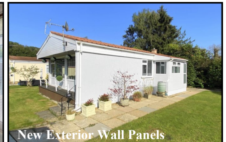
New Exterior Wall Panels