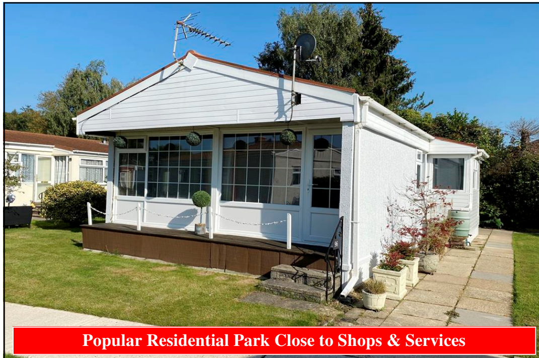
Popular Residential Park Close to Shops & Services

96 Gladelands Park, Ringwood Road, Ferndown, Dorset. BH22 9BW