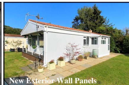
New Exterior Wall Panels