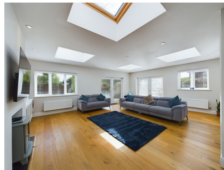
School Close, Holmer Green, High Wycombe, Buckinghamshire, HP15 6SR