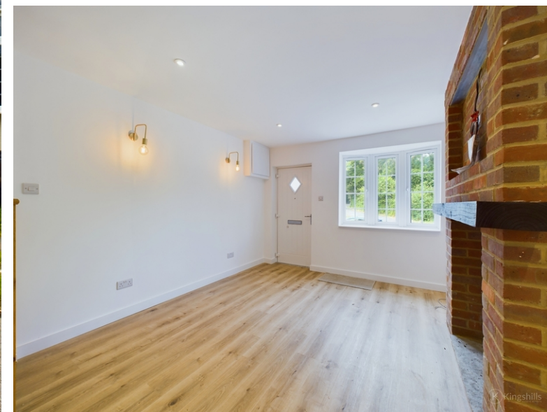
The Row, Lane End, High Wycombe, Buckinghamshire, HP14 3JU