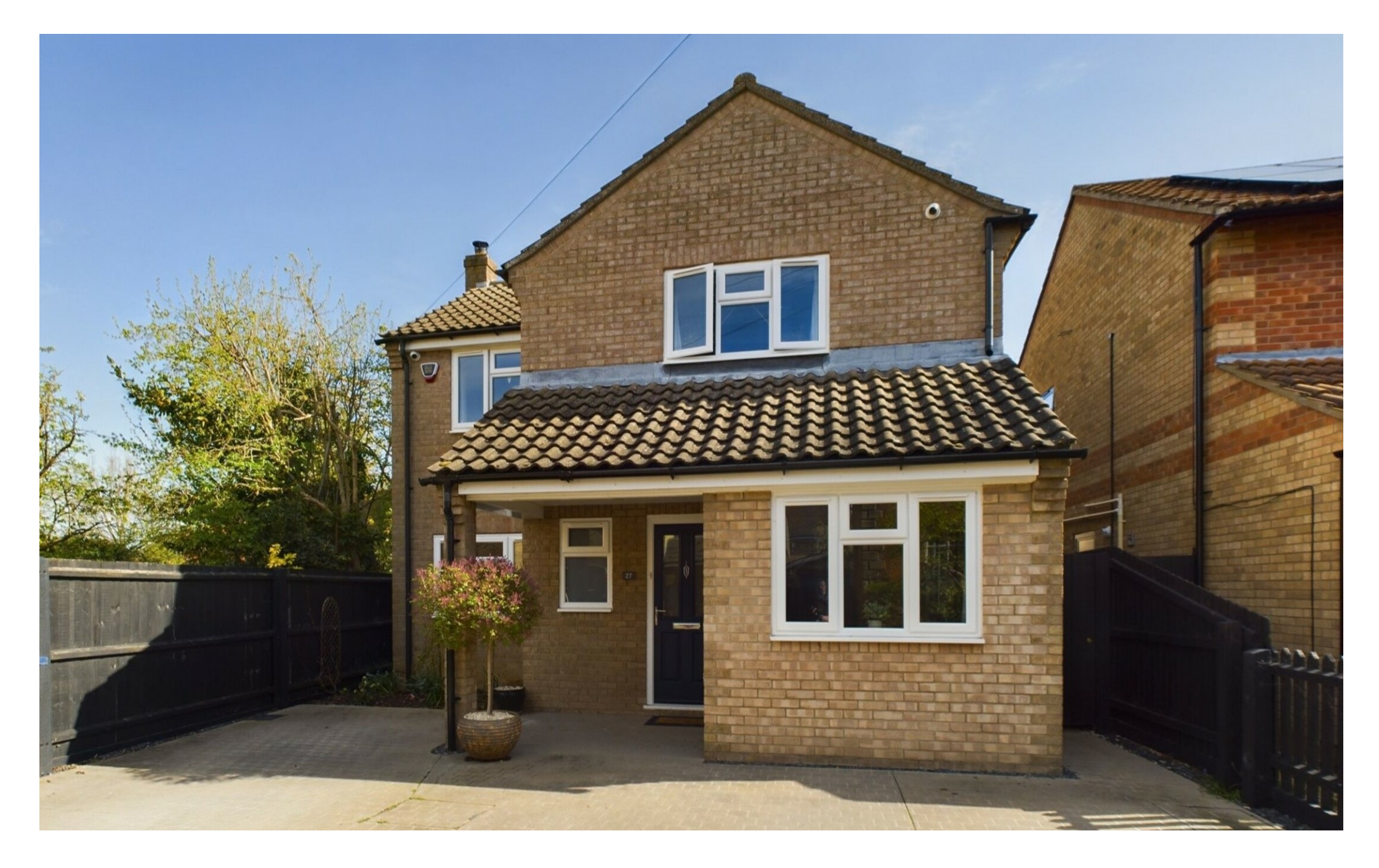
Rooks Street, Cottenham CB24 8QZ