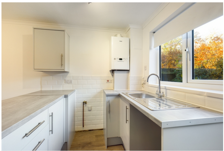
Primary Court, Cambridge, Cambridgeshire, CB4 1NB

£1,250 pcm Unfurnished 1 Bedrooms Available from 12/11/2024