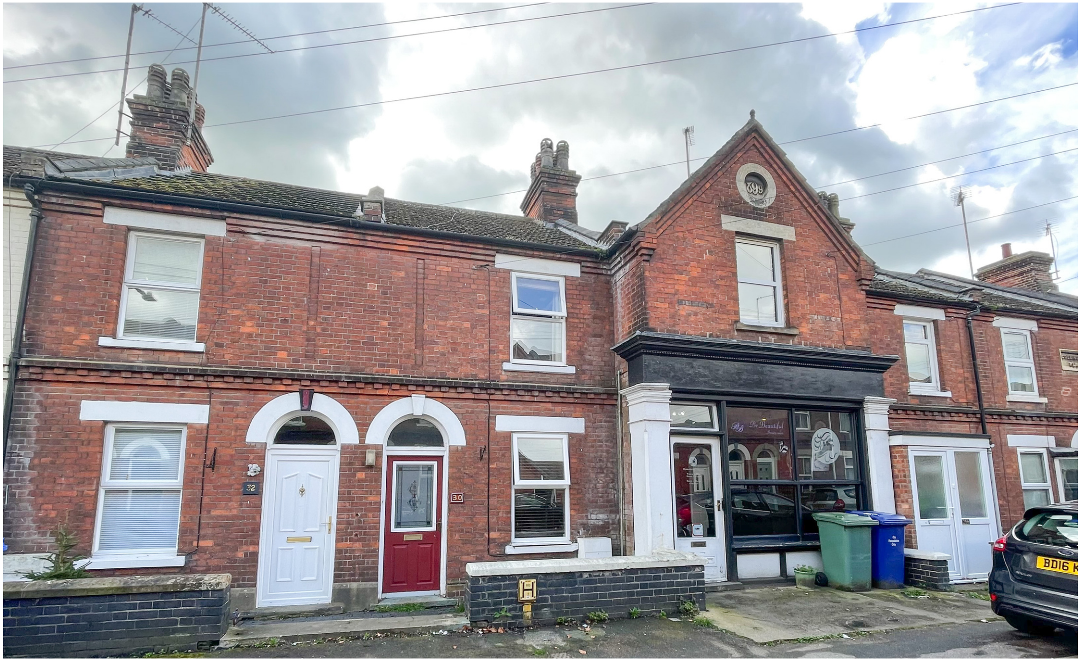
Nat Flatman Street, Newmarket, Suffolk