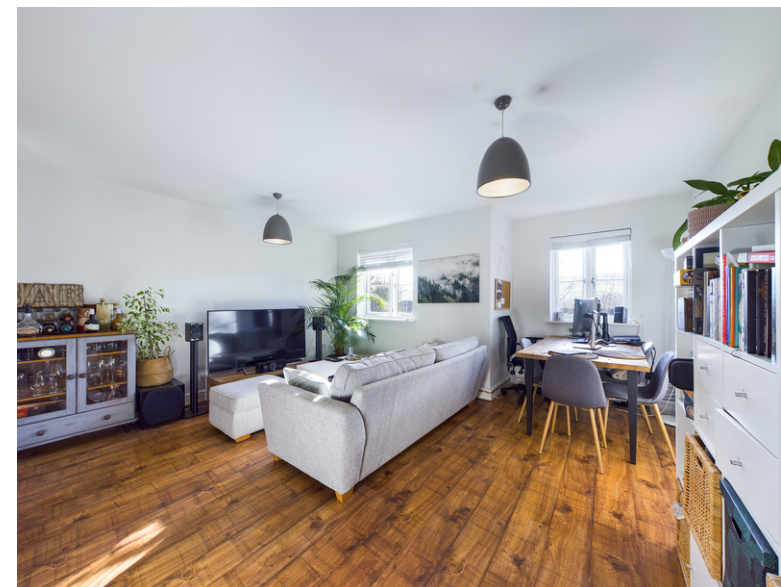
Flat 69, Aspen Court, Freer Crescent, High Wycombe, Buckinghamshire, HP13 7YG