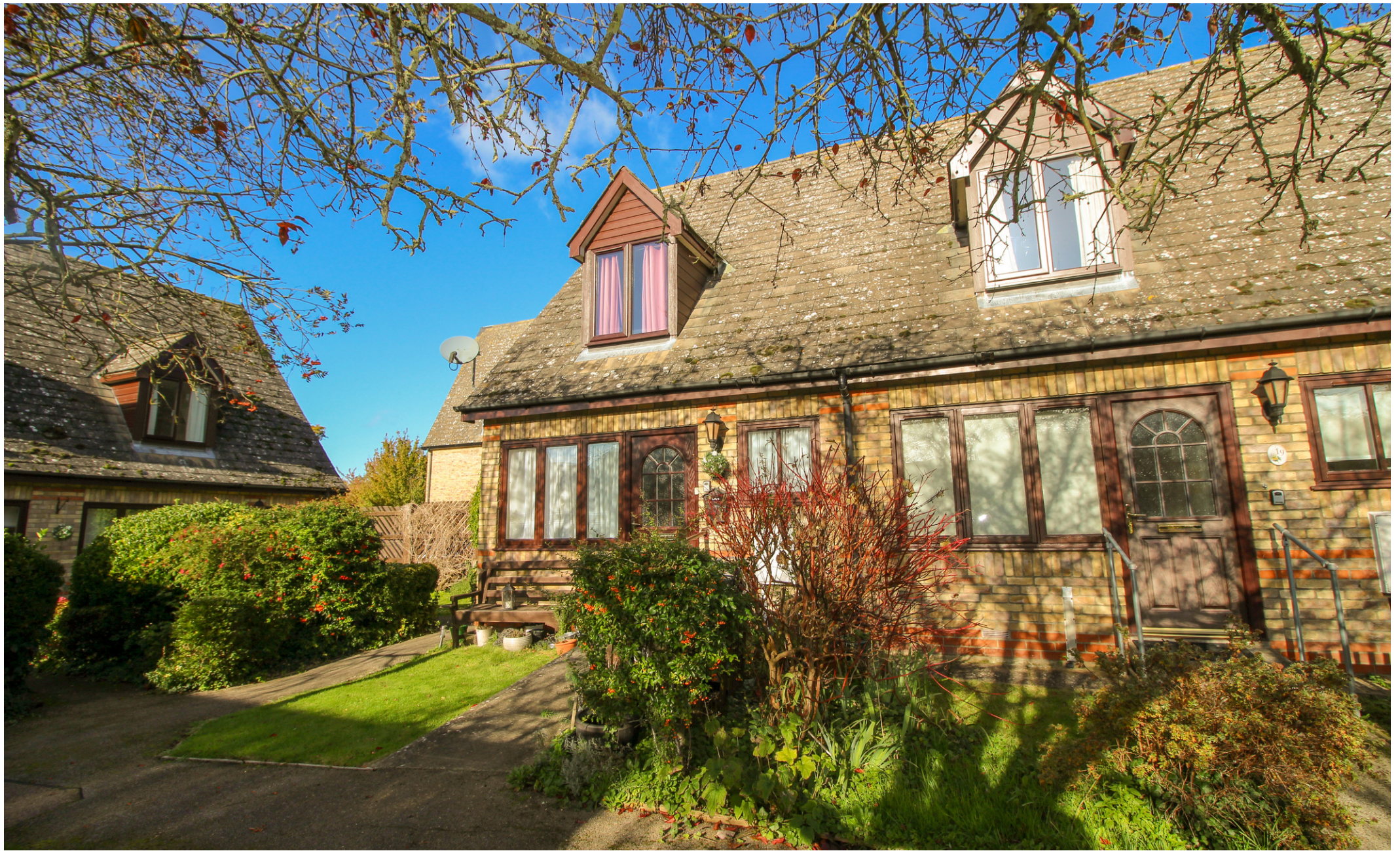
Ash Grove, Burwell. Cambridgeshire