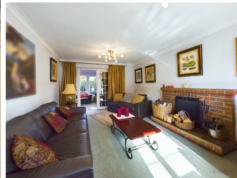
Kiln Lane, Lacey Green, Princes Risborough, Buckinghamshire, HP27 0PT