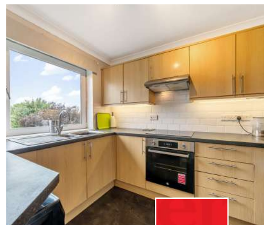
Flat 10 Haseley Court Ferndown Close, Taunton TA1 4TL