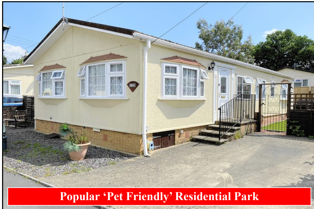
Popular 'Pet Friendly' Residential Park

113 The Square, Oaktree Park, St Leonards, Ringwood. BH24 2RL