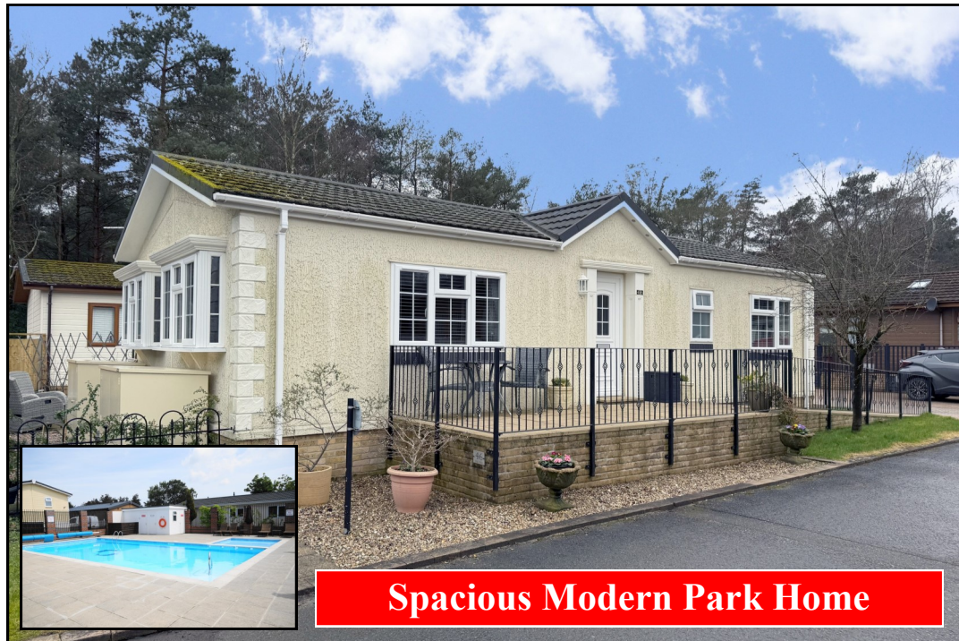
Spacious Modern Park Home

46 Tall Trees Park, Matchams Lane, Christchurch, Dorset. BH23 6TT