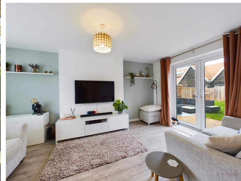
43 Wayfarers End, Longwick, Princes Risborough, Buckinghamshire, HP27 9FT