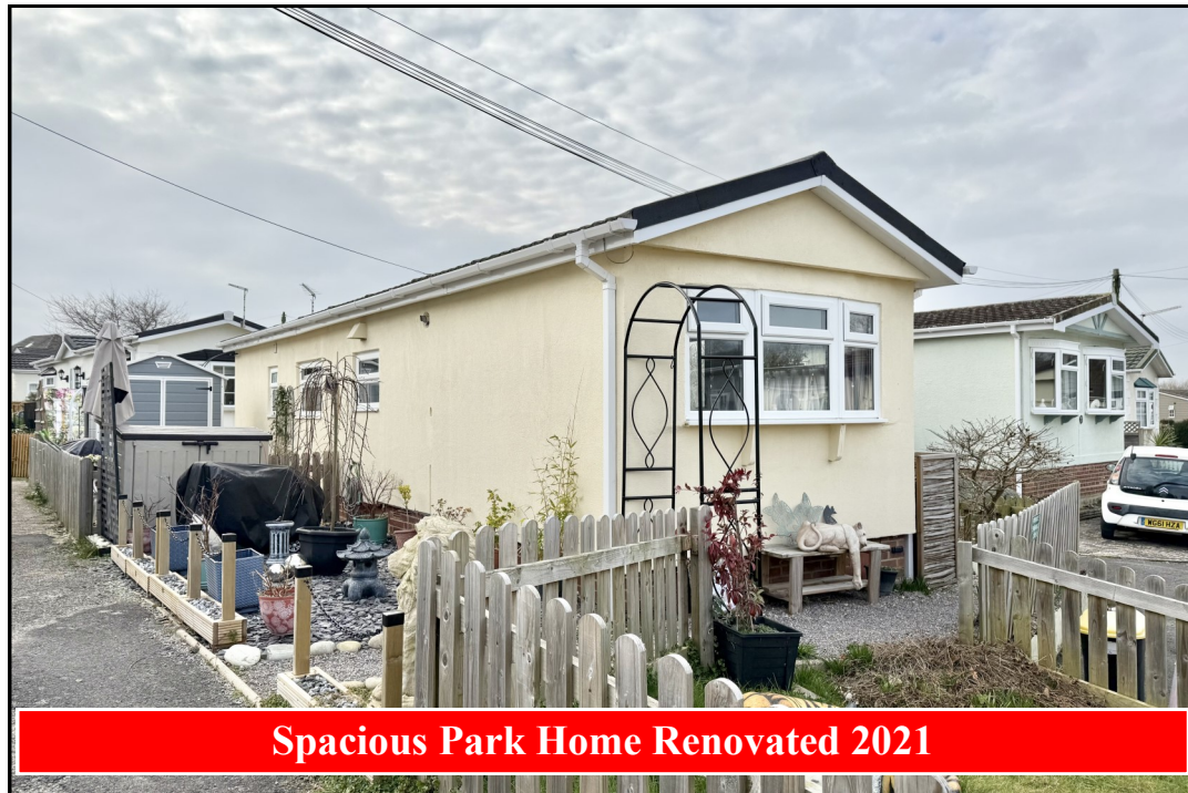
Spacious Park Home Renovated 2021

34 Iford Bridge Park, Old Bridge Road, Iford, Bournemouth. BH6 5RQ