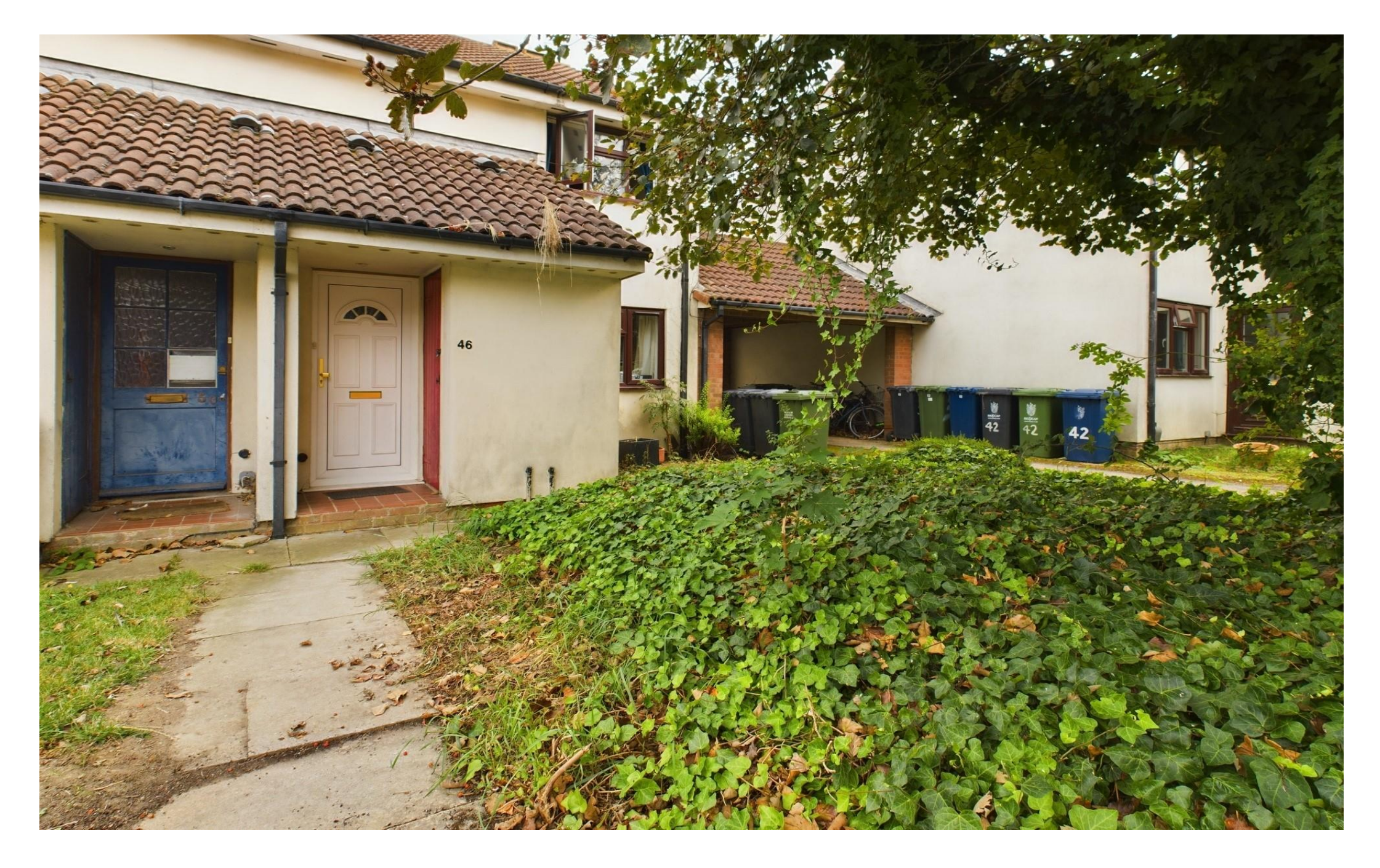
Caribou Way, Cambridge CB1 9XG