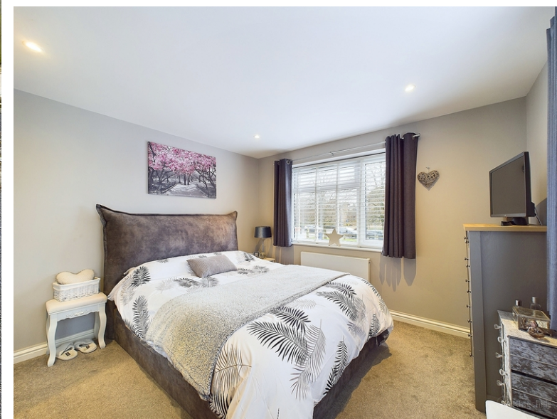
7 The Warren, Jackson Court, Hazlemere, Buckinghamshire, HP15 7EB