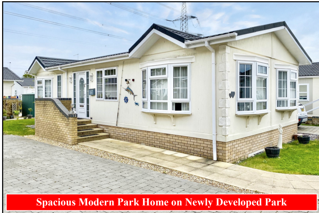
Spacious Modern Park Home on Newly Developed Park

12 Juniper Way, Deer's Court, Horton Road, Three Legged Cross, Wimborne. BH21 6FH