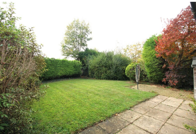
Thorpe Way, Cambridge, CB5 8UJ

£1,800 pcm Unfurnished 3 Bedrooms Available from 12/08/2024