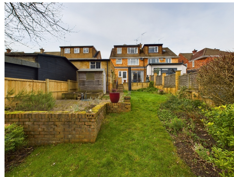
Marys Mead, Hazlemere, High Wycombe, Buckinghamshire, HP15 7DY