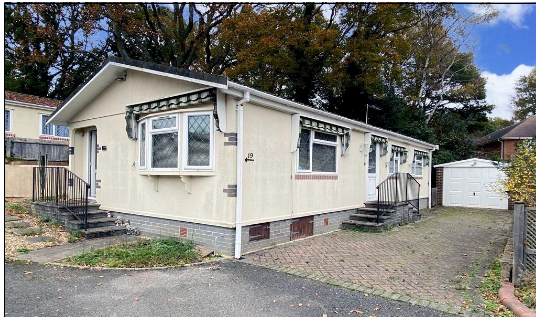
Spacious Park Home with Driveway & Garage

19 Dewlands Park, West Close, Verwood. BH31 6PR