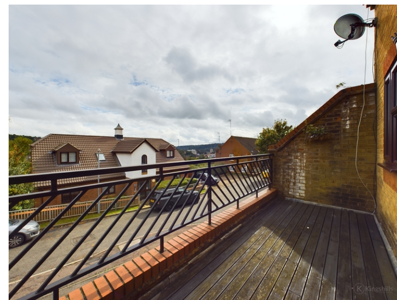
Flitcroft Lea, High Wycombe, Buckinghamshire, HP13 5LE