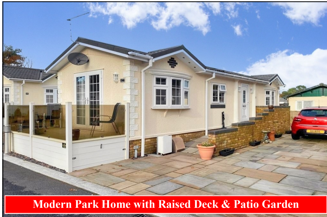
Modern Park Home with Raised Deck & Patio Garden

194 Pinehurst Park, West Moors, Ferndown. BH22 0BS