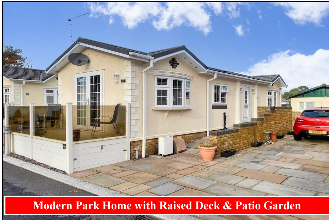
Modern Park Home with Raised Deck & Patio Garden

194 Pinehurst Park, West Moors, Ferndown. BH22 0BS