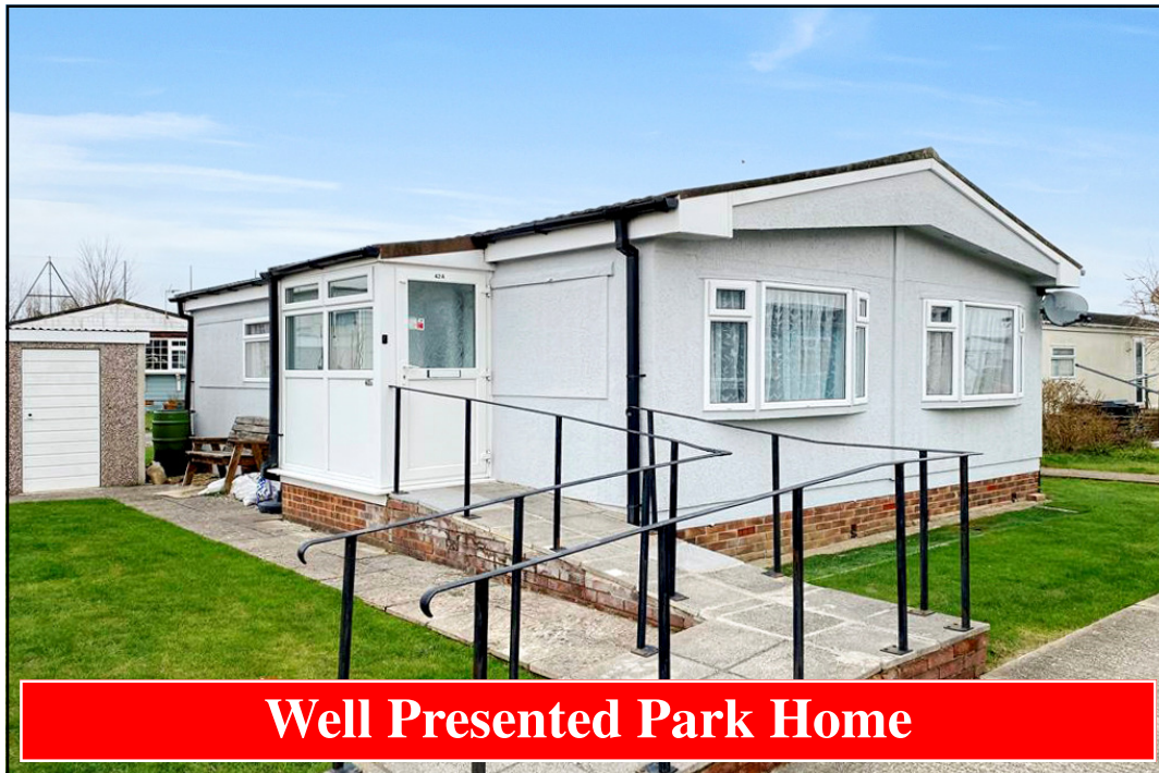
Well Presented Park Home

42a Selwood Park, Weymans Avenue, Kinson, Bournemouth. BH10 7JU