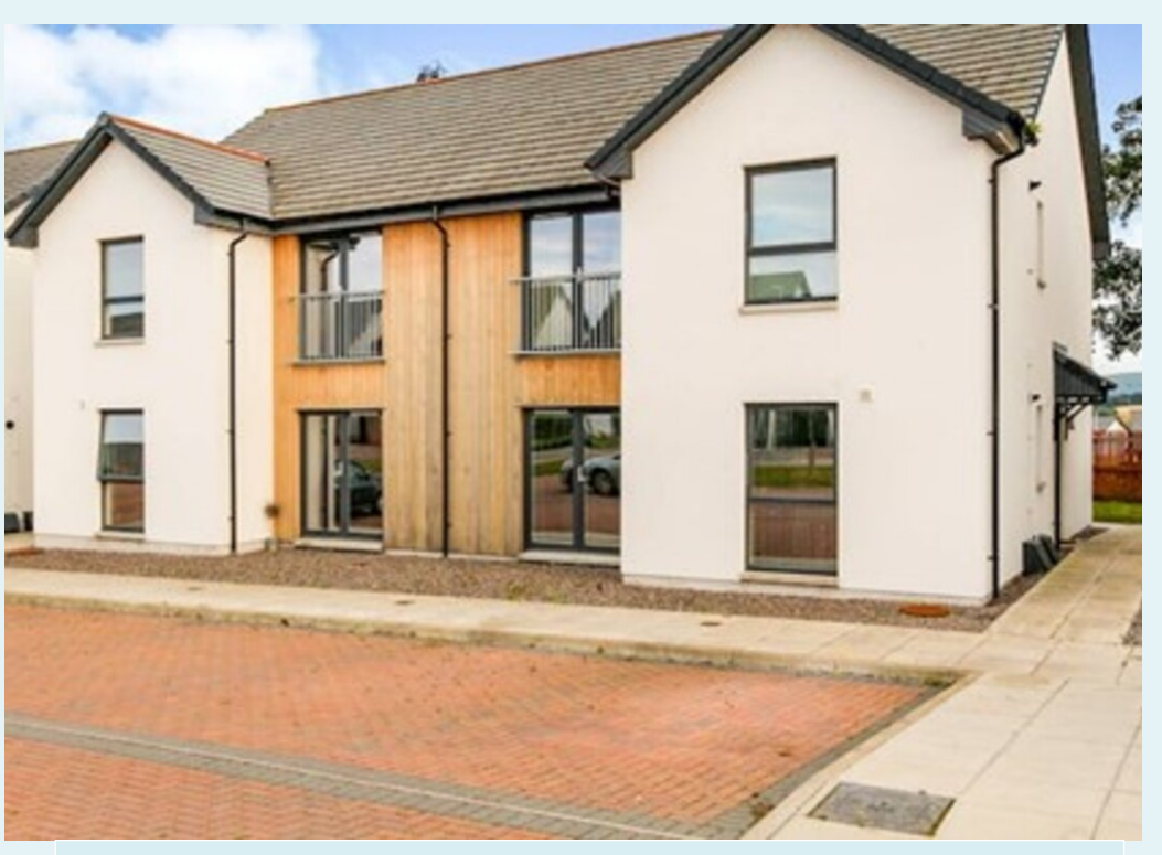
2 Bedroom Unfurnished 1st Floor Flat Strictly No Pets & No Smokers

Hallway with storage cupboard Open Plan Lounge & Kitchen Integrated Hob, Oven, Microwave, Dishwasher, Washer/Dryer, & Fridge Freezer 2 Bedrooms with Built-in Wardrobes Bathroom