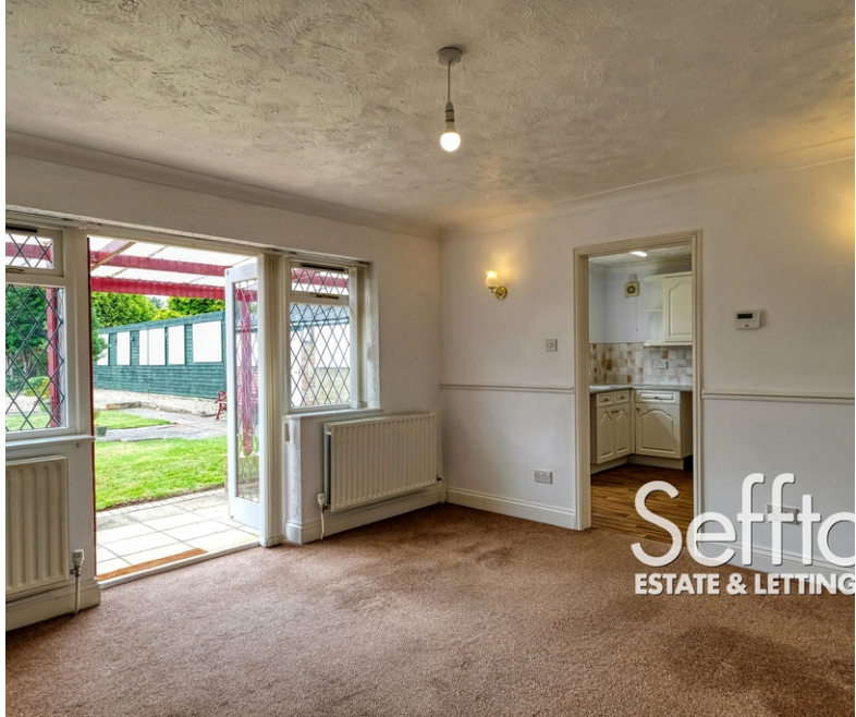
5 Greenborough Close, Norwich, NR7 9HL

FANTASTIC OPPORTUNITY to purchase this DETACHED, THREE BEDROOM BUNGALOW offered with NO ONWARD CHAIN. Situated down a quiet cul-de-sac in the sought after suburb of Sprowston, the property boasts a generous driveway, large rear garden and a substantial garage and workshop.