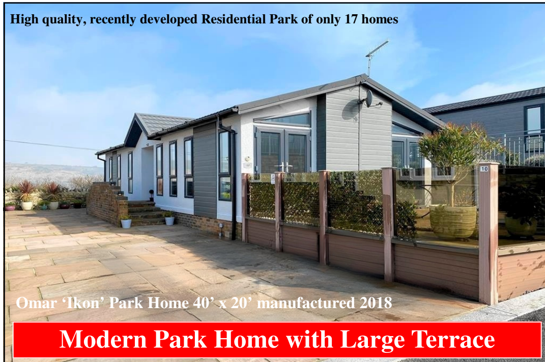
Omar 'Ikon' Park Home 40' x 20' manufactured 2018

High quality, recently developed Residential Park of only 17 homes