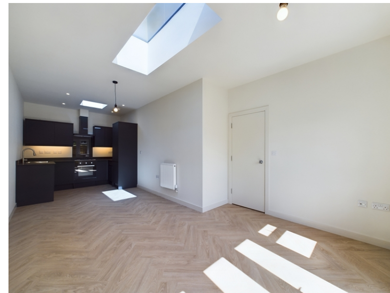
London Road, High Wycombe, Buckinghamshire, HP11 1DQ