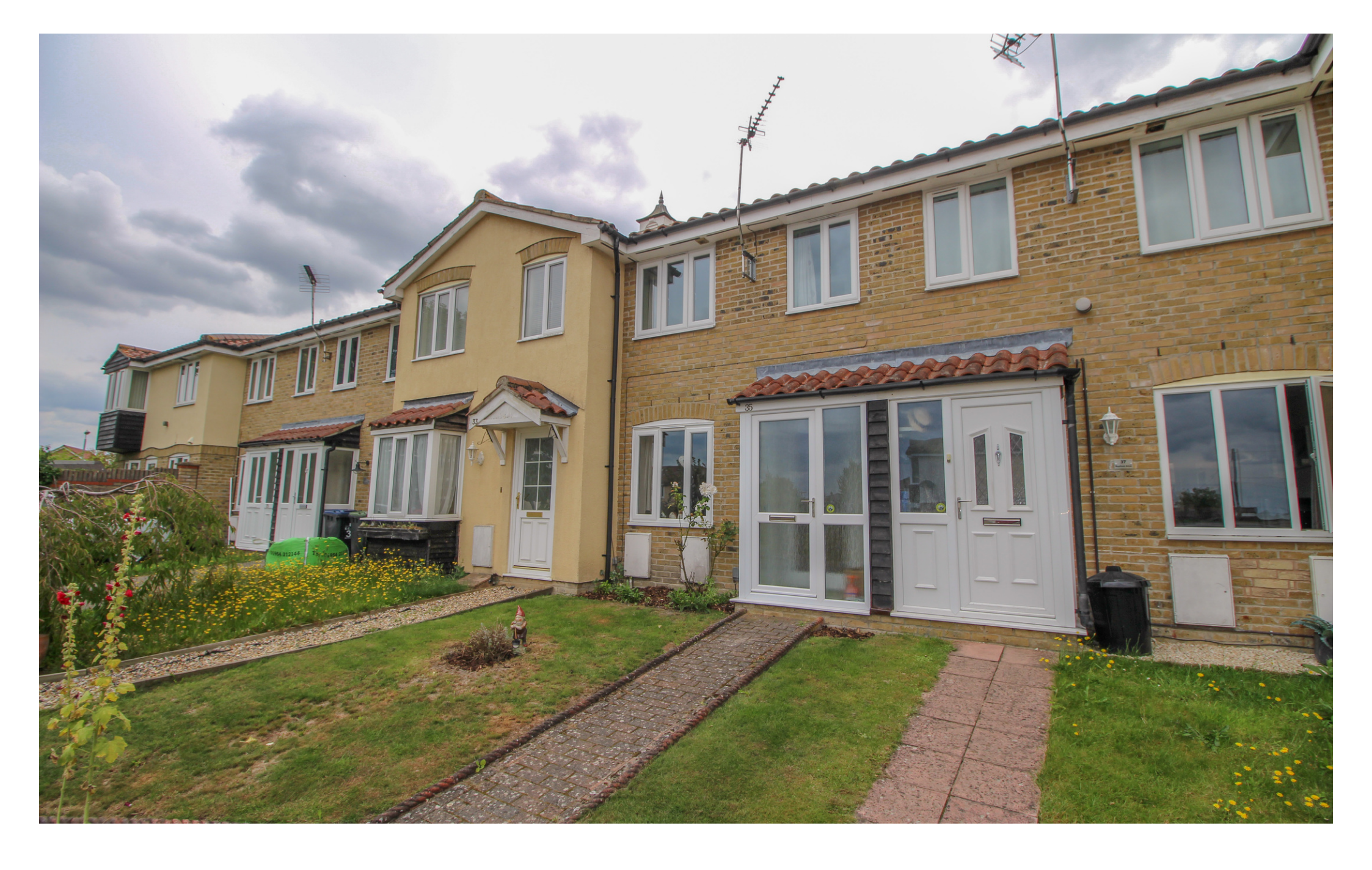
Bayfield Drive, Burwell