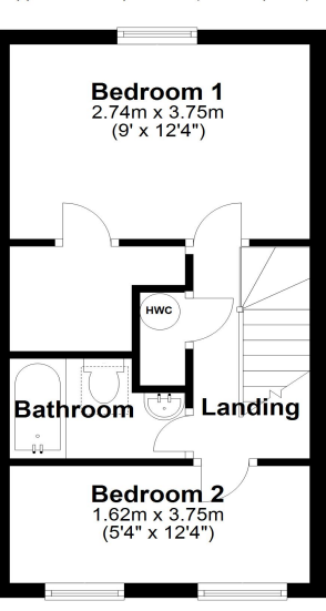
Total area: approx. 56.4 sq. metres (606.6 sq. feet)

Approx. 28.2 sq. metres (304.0 sq. feet)