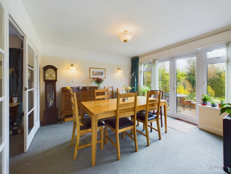
25 New Drive, High Wycombe, Buckinghamshire, HP13 6JS