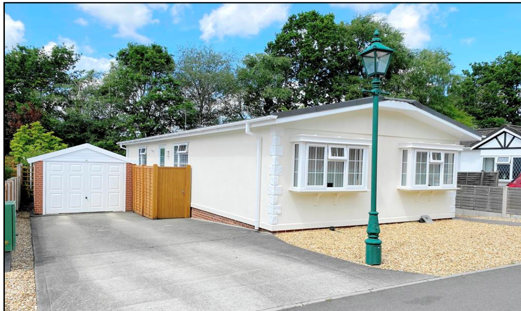
Exceptionally Spacious Park Home in Pristine Condition with Delightful Garden

23 Dewlands Park, West Close, Verwood. BH31 6PR