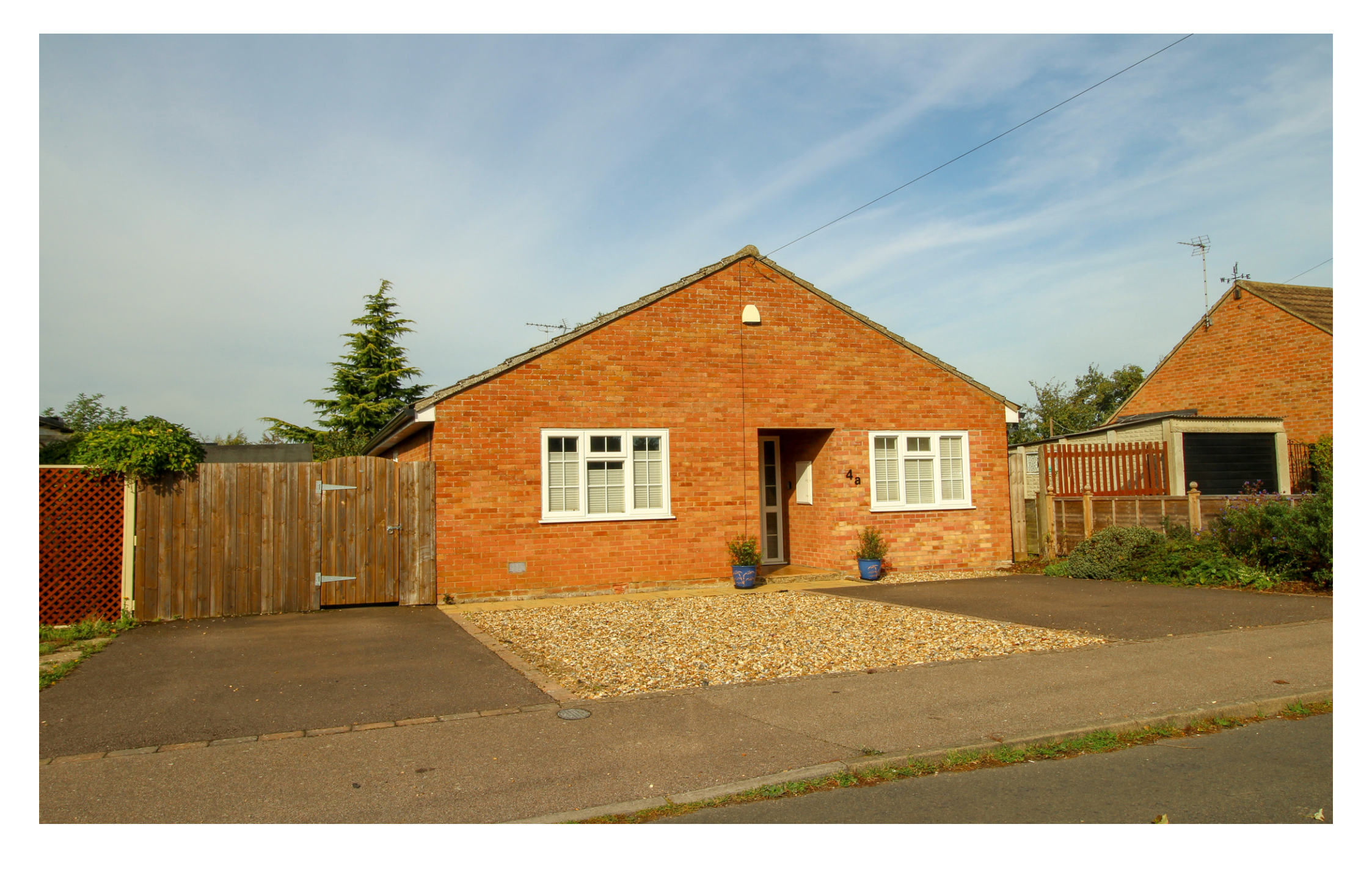
Northfields, Lode, Cambridge, Cambridgeshire