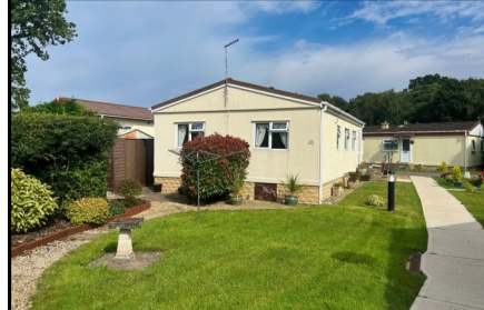
Pitch Fee: approx 190.72 per month Subject to Annual Review Council Tax Band: 'A' Tenur