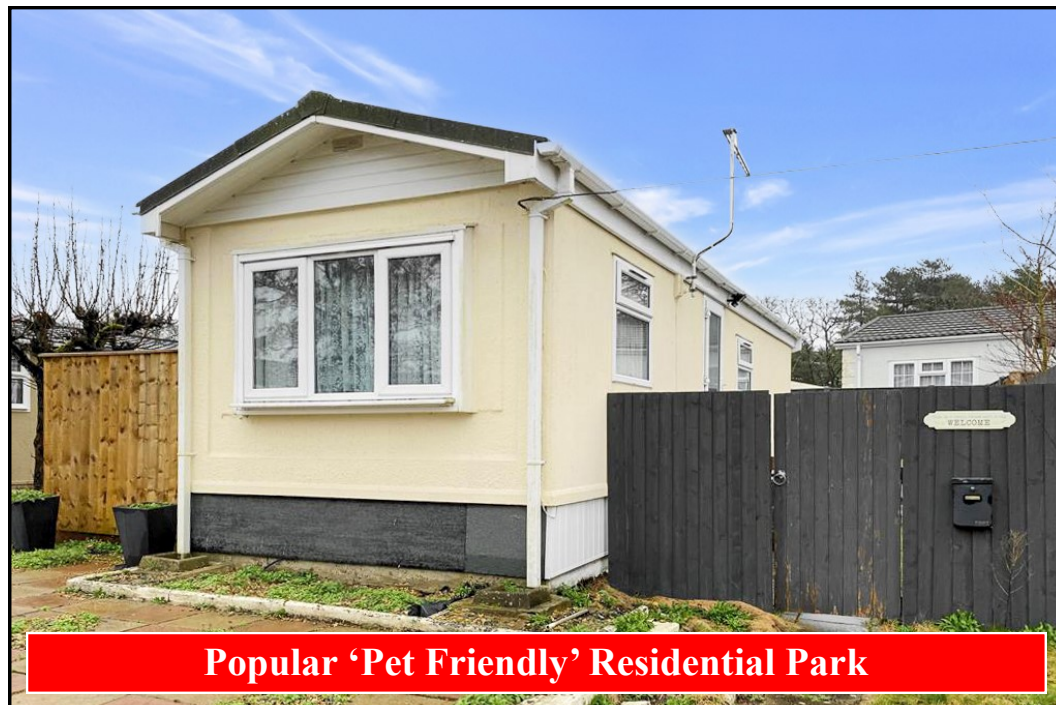
Popular 'Pet Friendly' Residential Park

109 The Square, Oaktree Park, St Leonards, Ringwood. BH24 2RL