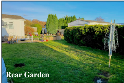
Pitch Fee: Approx £194.72 per month Subject to Annual Review Council Tax Band: 'A' Tenure: