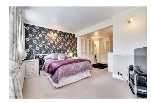
Chelmsford £550,000 5-bed semi detached house