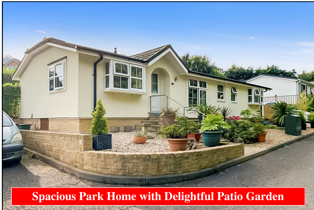
Spacious Park Home with Delightful Patio Garden

10 Upton Glen Park, Upton, Ringstead, Dorchester, Dorset. DT2 8NE