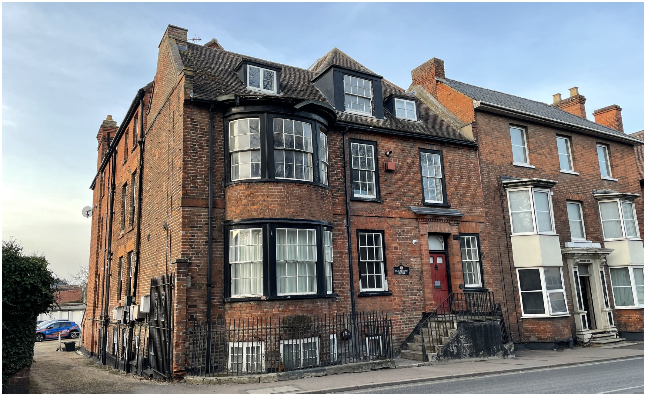
Clarendon House, High Street, Newmarket