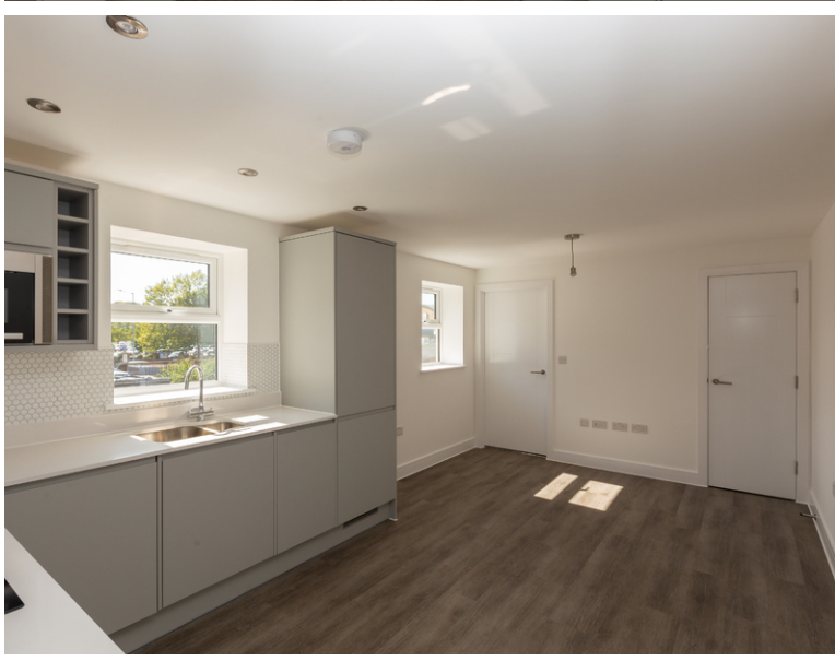
Hughenden Road, High Wycombe, HP13 5HS