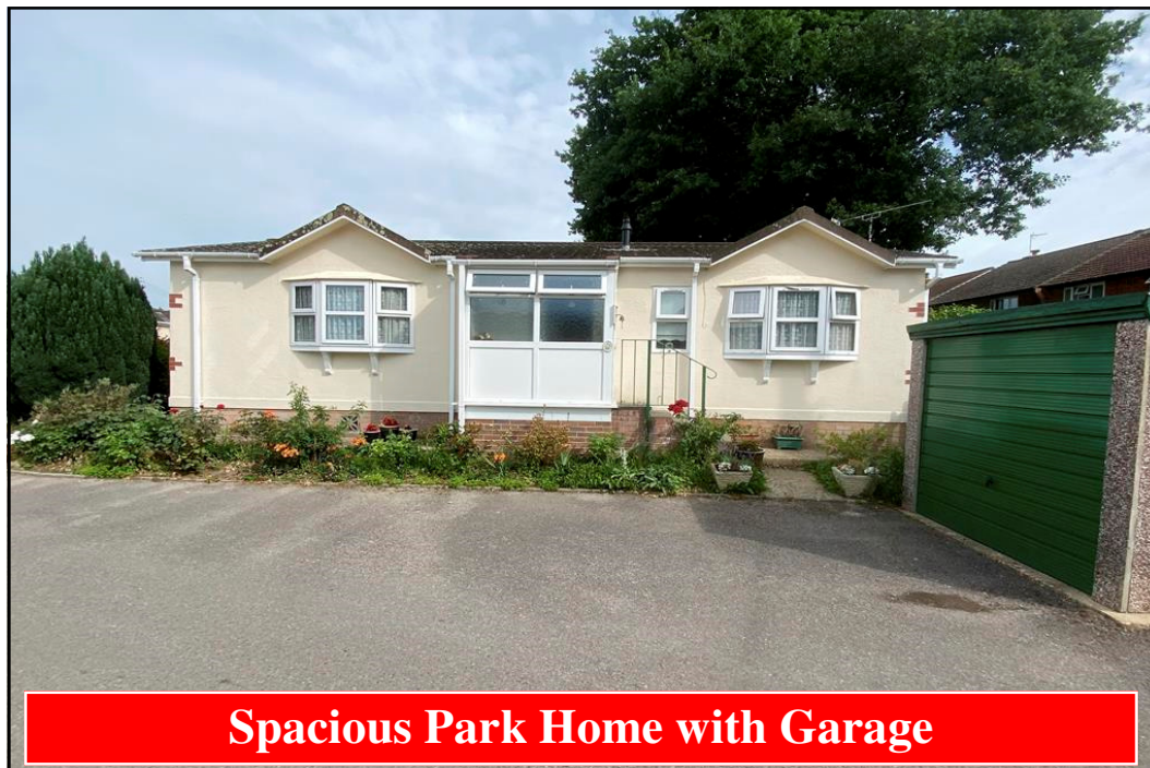
Spacious Park Home with Garage

68 Hillbury Park, Alderholt, Fordingbridge. SP6 3BW