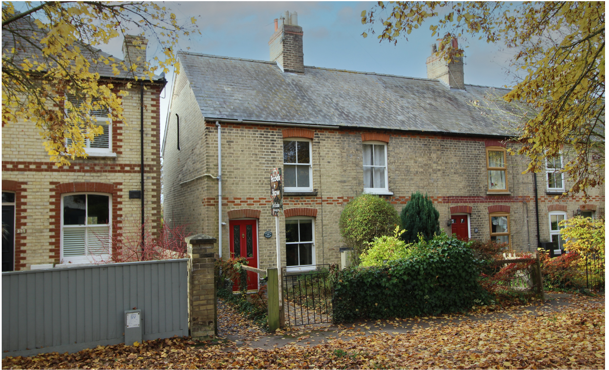
The Causeway, Burwell, Cambridgeshire