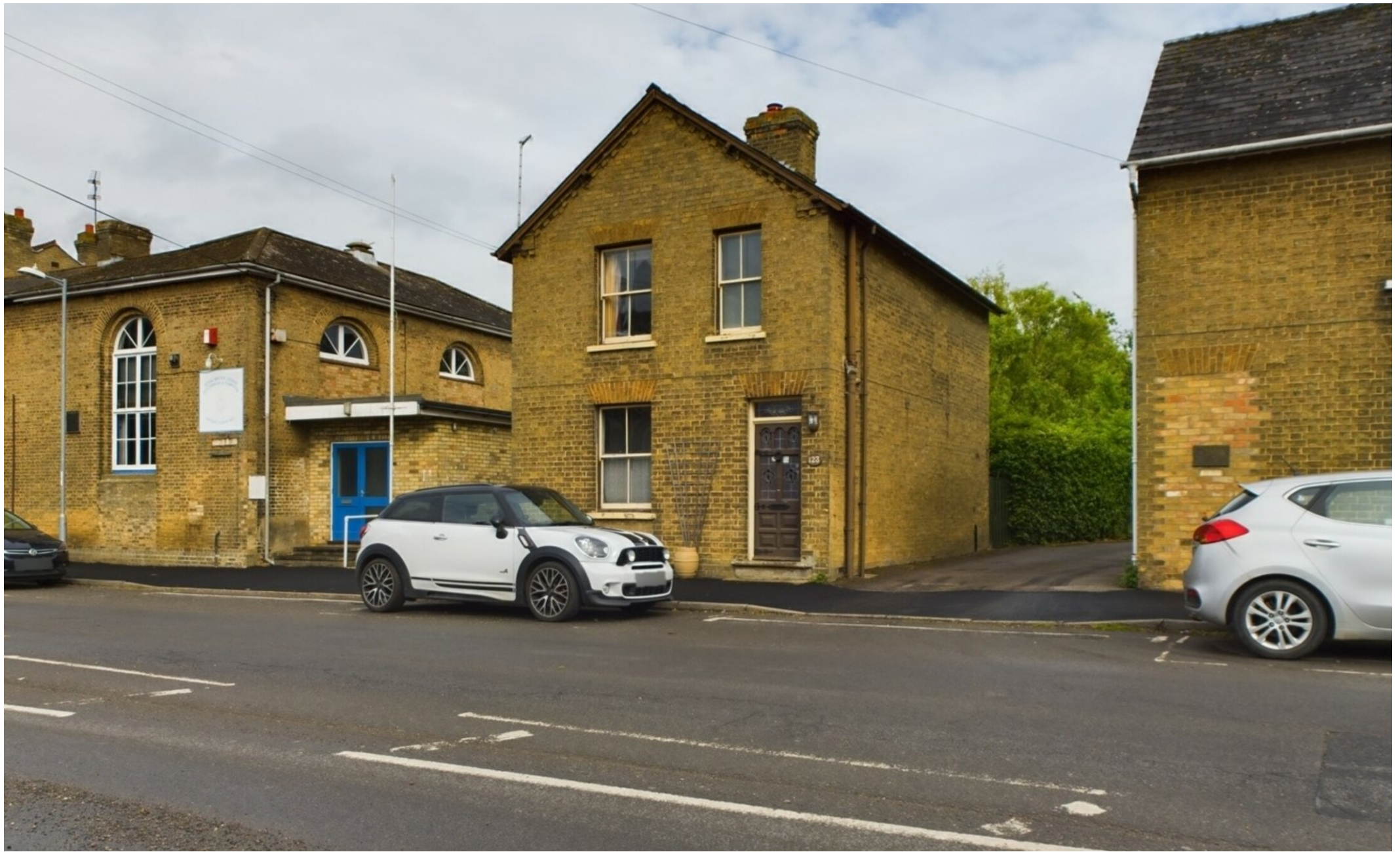
High Street, Cottenham, Cambridge CB24 8SD