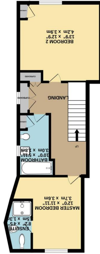
1ST FLOOR 494 sq. ft. (45.9 sq. m.) approx.