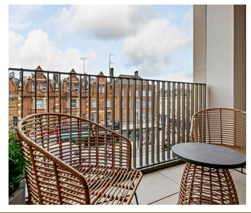
Modern 1 Bed Apartment with Balcony to Rent on Edgware Road in West End Gate in London.